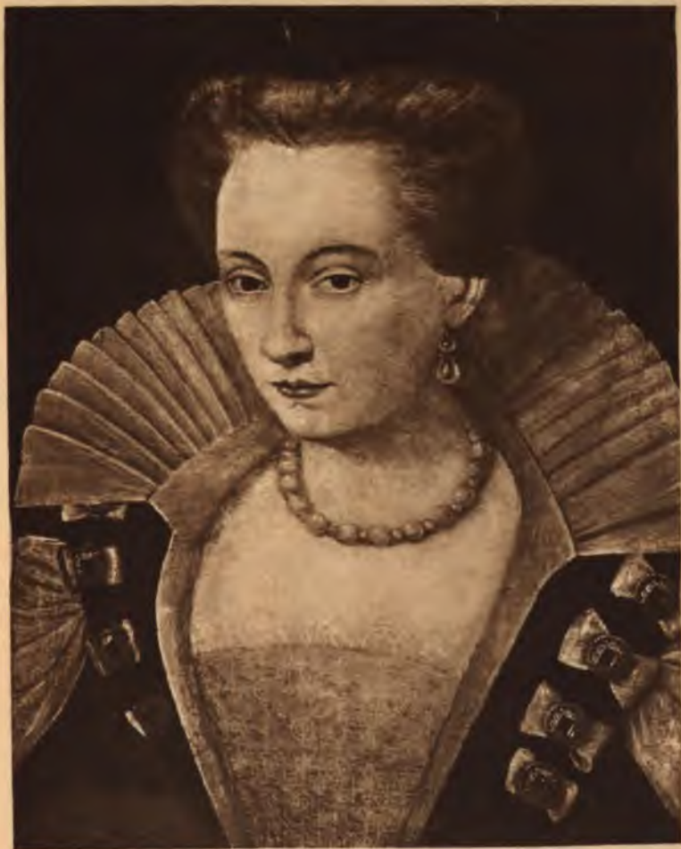
Louise de Lorraine wife of Henri III